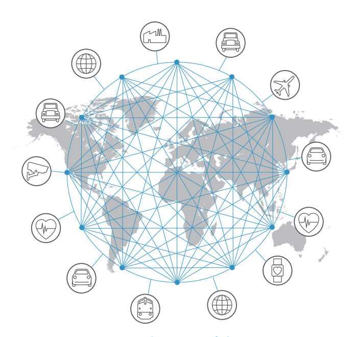
Figure 1: The Internet of Things