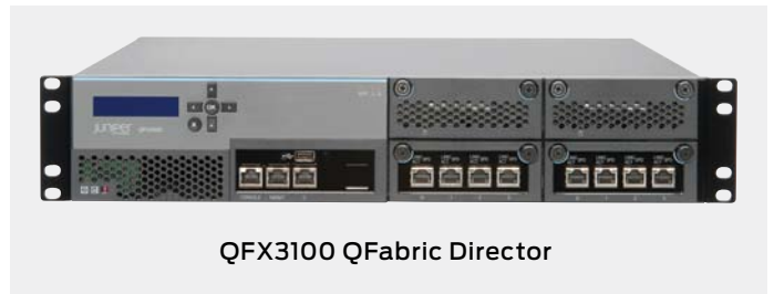
QFX3100 QFabric Director

The QFabric family of products run the same reliable and high-performance Juniper Networks Junos operating system that is used by Juniper Networks EX Series Ethernet Switches, Juniper Networks routers, and Juniper Networks SRX Series Services Gateways. By utilizing a common operating system, Juniper delivers a consistent implementation and operation of control plane features across products. To maintain that consistency, Junos OS adheres to a highly disciplined development process, follows a single release track, and employs a highly available modular architecture that prevents isolated failures from bringing down an entire system. These attributes are fundamental to the core value of the software, enabling Junos OS-powered products to be updated simultaneously with the same software release. Features are fully regression tested, making each new release a superset of the previous version; customers can deploy the software with confidence that existing capabilities will be maintained and operate in the same way.