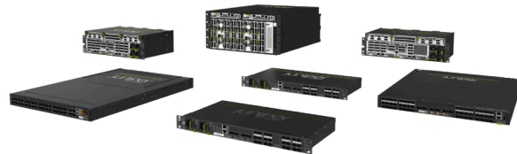
Figure 1. Juniper Networks ACX7000 Family—engineered for the IP service fabric of a Juniper Cloud Metro

The ACX7000 Family of routers, purposely built for the IP-service fabric underlay of a Juniper® Cloud Metro , leverages the industry's fastest chipset, provides a unique balance of system design, and delivers the most sustainable high-performance portfolio available in the market. Managed by Junos® OS Evolved and Juniper Paragon Automation , ACX7000 routers are embedded with Paragon Active Assurance and Zero Trust security, enabling operators to deliver highly differentiated customer experiences. Available in hardened, fixed, fixed-plus-modular, and modular designs, these energy and footprint efficient, multiservice routers support high-precision timing technologies and are engineered for service provider, enterprise (including PON with the Juniper Unified PON Solution ), IoT, and 4G/5G mobile applications.