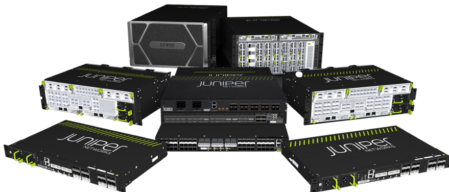
Figure 2. Juniper ACX7000 family—engineered for the IP service fabric of a Juniper Cloud Metro

The advent of small form-factor technologies like QSFP56-DD pluggable optics and 400ZR/ZR+ pluggable transceivers, enables the selection on a port-by-port basis between grey client interfaces (400G LR4) for shorter distances or coherent DWDM interfaces (400ZR/ZR+) for longer distances, as well as transport over an active optical line system—without sacrificing platform density. Juniper integrates QSFP-DD interfaces in its solutions, including the ACX7000 family, enabling considerable capital savings and substantial sustainability benefits for operators compared to the traditional use of external DWDM transponders.