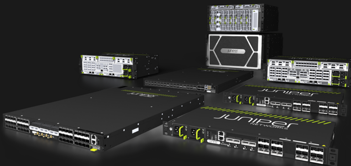
ACX7000 Series Family