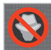
Respond Deceive the attacker and prevent the attack