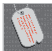
Track Track attackers beyond the IP address