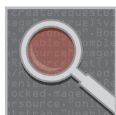
Detect Detect attackers with no false positives

With Juniper's Mykonos Web Security solution (MWS), company websites are secured with a groundbreaking Intrusion Deception solution that detects, tracks, profiles, and prevents Web attacks. Using deceptive tar traps to detect attackers with absolute certainty, MWS inserts detection points into the code (including URLs, forms, and server files) to create a random and variable minefield all over the Web application. These tar traps allow you to detect attackers during the reconnaissance phase of the attack, before they have successfully established an attack vector. Attackers are detected when they manipulate the detection points inserted into the code. And because attackers are manipulating code that has nothing to do with your website or Web application, you can be absolutely certain that it is a malicious action, with no chance of a false positive.