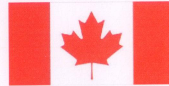
The Communications Security Establishment of the Government of Canada