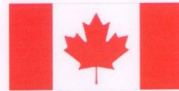
The Communications Security Establishment of the Government of Canada