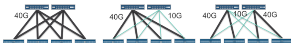
Figure 2: Good and Bad Spine and Leaf Examples

Example 1: If you want to build a VCF with two spine devices, we recommended that you use all 40-Gbps links, as shown in the first topology in Figure 2 on page 17 . In this topology, the multicast bandwidth for the VCF is 40 Gbps.