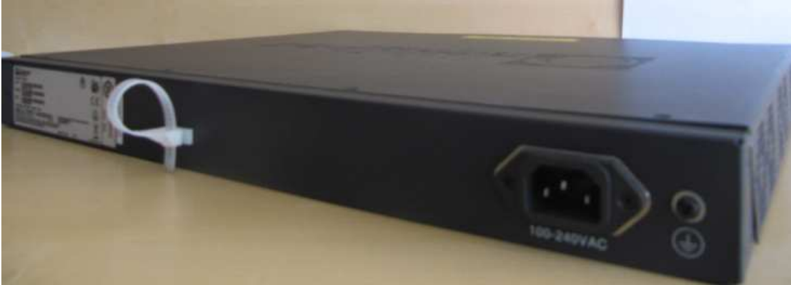
Figure 2-1: SRX240H-POE Chassis different views