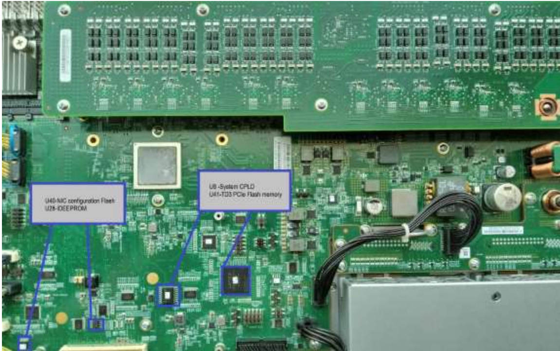
Figure 3-7: Locate System-CPLD, PCIe flash NIC IDEEPROM and MB-IDEEPROM.