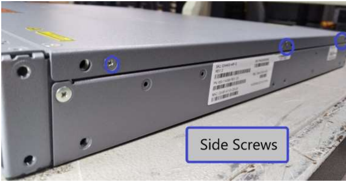
Figure 3-3: Side screws of Top Cover