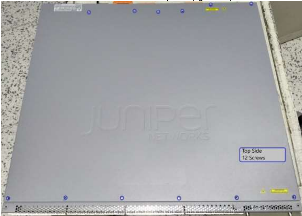
Figure 3-2: Top cover screws

3. Remove thirteen screws on top side (figure 3-2).