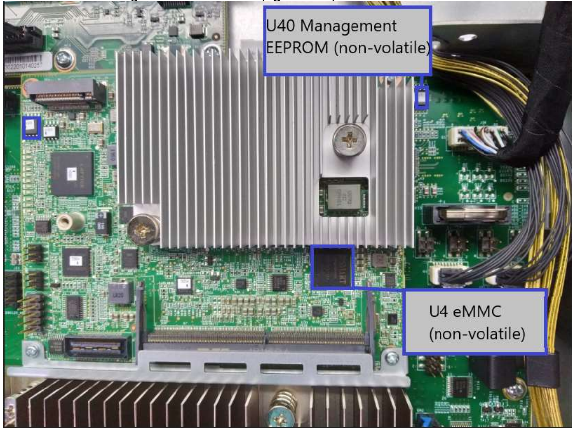
Figure 3-5: Locate NV storage (eMMC)

5. Locate NV storage on Main Board (figure 3-5).