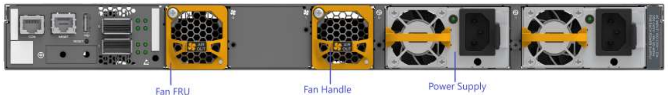
Figure 3-1: PSU FRUs, FAN FRUs