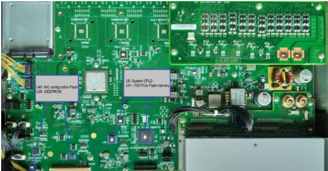
Figure 3-7: Locate System-CPLD, PCIe flash NIC IDEEPROM and MB-IDEEPROM.