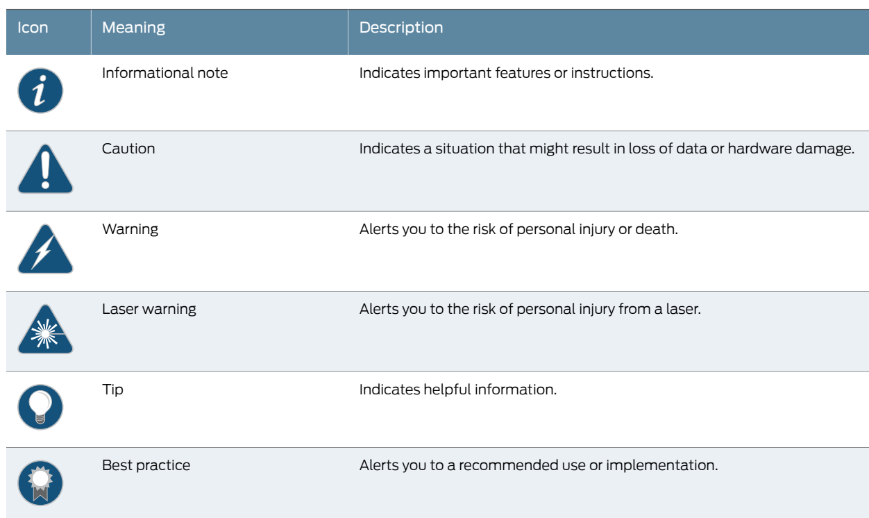
Table 1: Notice Icons

Table 2 on page x defines the text and syntax conventions used in this guide.