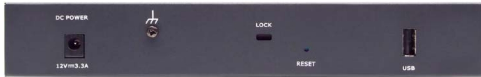
Figure 2: Rear of the SSG 5 device