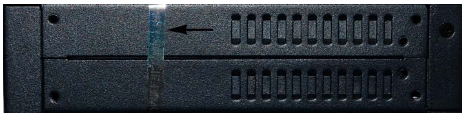
Figure 5: Side of both SSG 5 and 20 devices, with location of tamper evident seal