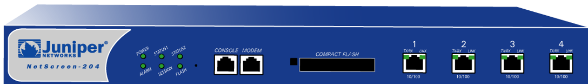
Figure 1: Front of the NetScreen-204 device