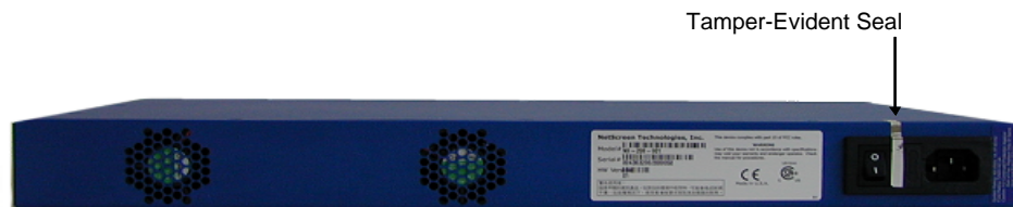
Figure 2: Tamper evident seal on power interface