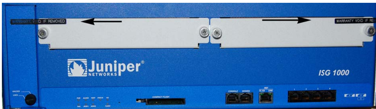
Fig. 1: Front of the ISG 1000, with location of tamper evident seals