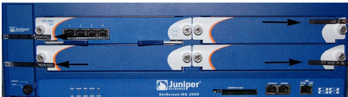
Fig. 3: Front of the ISG 2000, with location of tamper evident seals