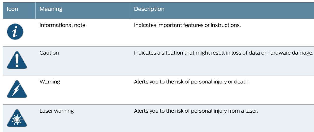
Table 1: Notice Icons

Table 2 on page xii defines text and syntax conventions that we use throughout the E Series and JunosE documentation.