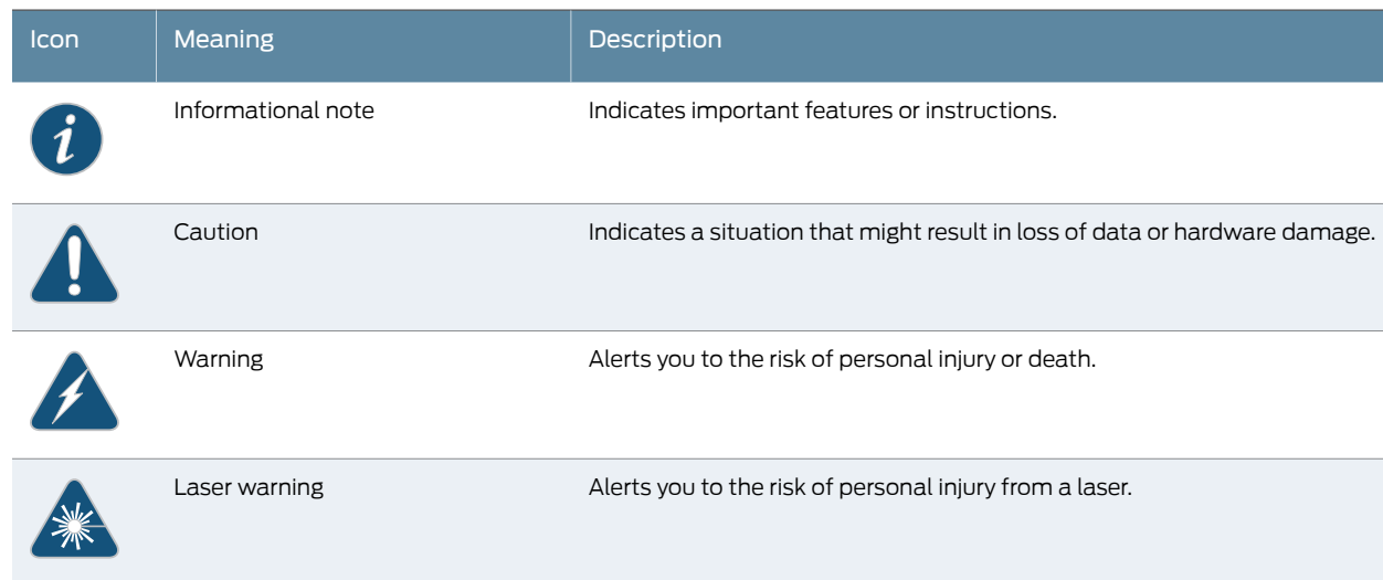
Table 1: Notice Icons

Table 2 on page x defines text and syntax conventions that we use throughout the E Series and JunosE documentation.