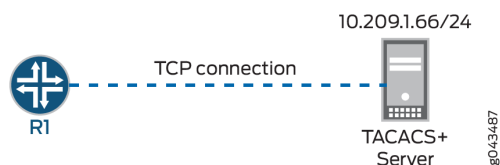
Figure 2: Topology

Figure 2 on page 92 illustrates a simple topology, where Router R1 is a Juniper Networks device and has a TCP connection established with a TACACS+ server.