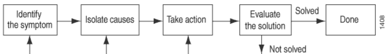
Figure 2: Process for Diagnosing Problems in Your Network

By applying the standard four-step process illustrated in Figure 2 on page 39 , you can isolate a failed node in the network. Note that the functionality described in this section is not supported in versions 15.1X49, 15.1X49-D30, or 15.1X49-D40.