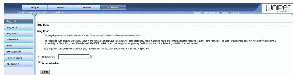
Figure 1: J-Web Layout