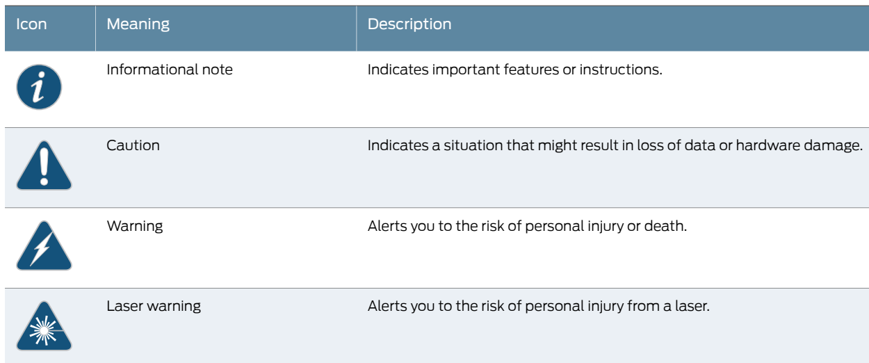
Table 1: Notice Icons

Table 2 on page ix defines the text and syntax conventions used in this guide.