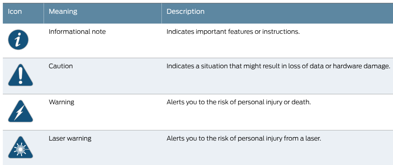
Table 1: Notice Icons

Table 2 on page ix defines the text and syntax conventions used in this guide.