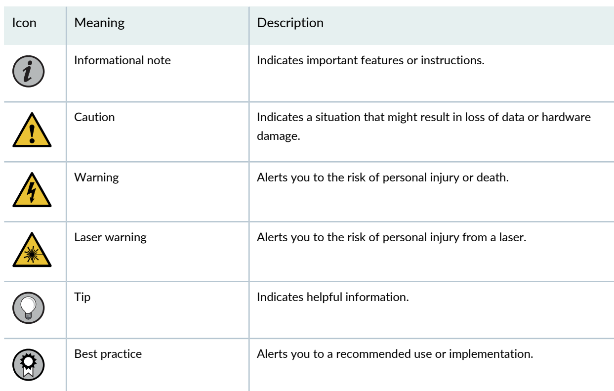
Table 1: Notice Icons

Table 2 on page viii defines the text and syntax conventions used in this guide.