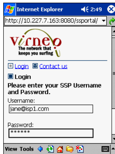
Figure 3: Sample Login Page for a Residential Portal on a PDA

Web-based residential portals that you develop for the SRC software are compatible with PDAs. Figure 3 on page 5 shows a login page for a sample residential portal that is being accessed from a PDA.