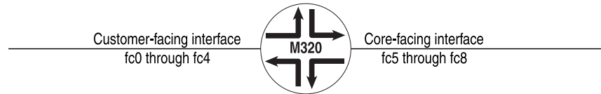
Figure 1: Customer-Facing and Core-Facing Forwarding Classes

interface, and fc5 through fc8 correspond to classifiers for the core-facing interface, as shown in Figure 1 on page 17 .