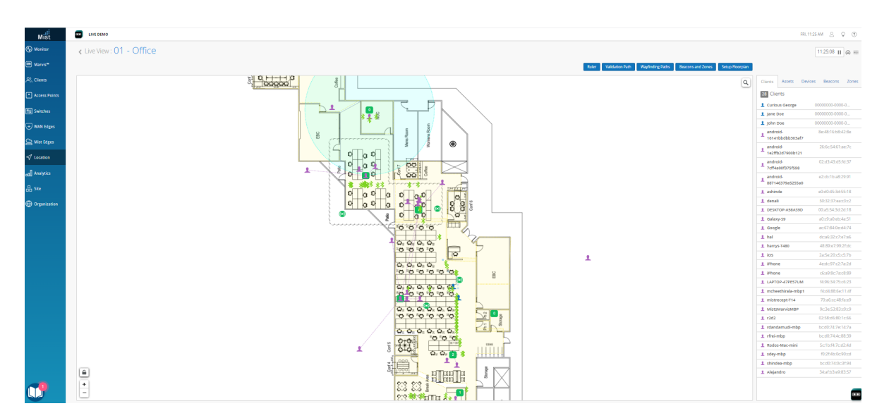
Figure 3: Indoor Location Services Interface