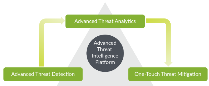
Juniper ATP Appliance components