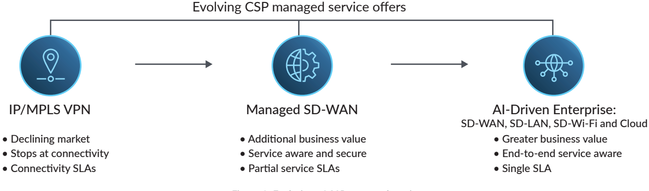
Figure 1: Evolution of CSP managed services