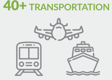
State, regional, and metropolitan transit, airports, and ports