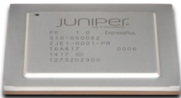
Figure 1: The custom-built Juniper Q5 ASIC

The QFX10002 switches are built with Juniper custom Q5 ASICs, which offer industry-leading performance and scale with 1 Tbps of switching throughput and support for network virtualization with VXLAN, Ethernet VPN (EVPN), and MPLS. The Q5 ASIC is embedded with on-chip analytics capabilities, along with Precision Timing Protocol and high-frequency monitoring.