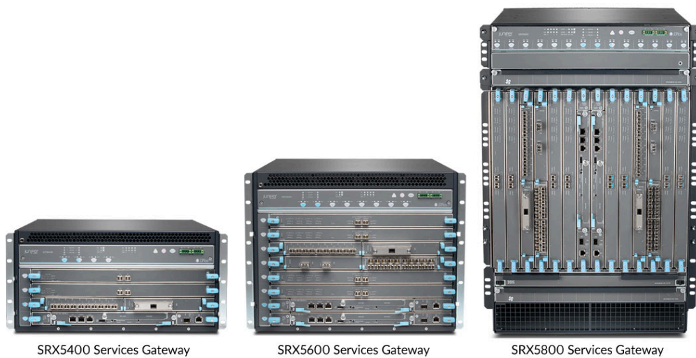
SRX5400 Services Gateway