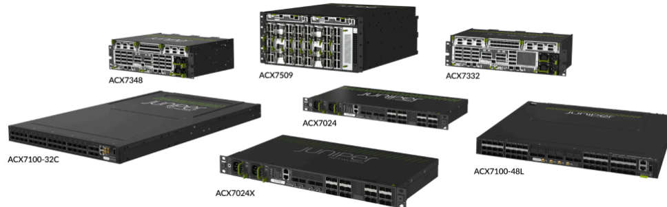
Figure 2. Juniper ACX7000 family—engineered for the IP service fabric of a Juniper Cloud Metro

The advent of small form-factor technologies like QSFP56-DD pluggable optics and 400ZR/ZR+ pluggable transceivers, enables the selection on a port-by-port basis between grey client interfaces (400G LR4) for shorter distances or coherent DWDM interfaces (400ZR/ZR+) for longer distances, as well as transport over an active optical line system—without sacrificing platform density. Juniper integrates QSFP-DD interfaces in its solutions, including the ACX7000 family, enabling considerable capital savings and substantial sustainability benefits for operators compared to the traditional use of external DWDM transponders.