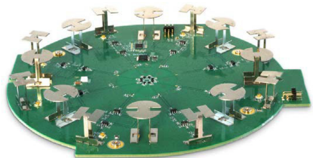
Bluetooth Antenna Array

vBLE enables businesses to provide rich location-based experiences that are engaging, accurate, real-time, and scalable.