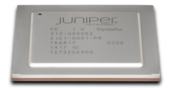
Figure 1: The custom-built Juniper Q5 ASIC

The QFX10002 switches are built with Juniper custom Q5 ASICs, which offer industry-leading performance and scale with 1 Tbps of switching throughput and support for network virtualization with VXLAN, Ethernet VPN (EVPN), and MPLS. The Q5 ASIC is embedded with on-chip analytics capabilities, along with Precision Timing Protocol and high-frequency monitoring.