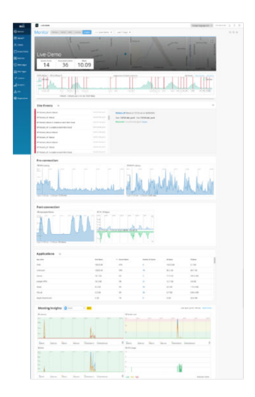
Figure 3: WAN Insights

Know exactly how Session Smart Routers or SRX Series gateways are performing with metrics and insights down to the port level. These include CPU, memory utilization, bytes transferred, traffic utilization, and power draw. WAN Assurance also logs gateway events, like configuration changes and system alerts. WAN and IPsec utilization insights tell you how much traffic traverses your encrypted tunnel versus your local breakout. You also get visibility into per-user and per-application performance and experiences (Figure 3).