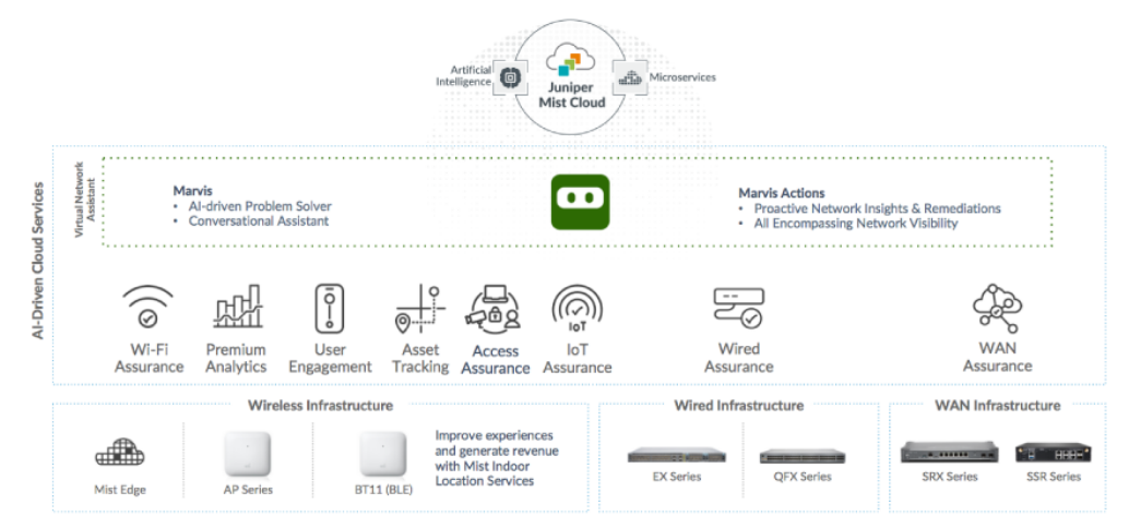
Figure 2: Al-Driven Enterprise Portfolio Overview