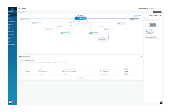
Figure 4: Marvis Actions

Marvis Virtual Network Assistant moves IT operations closer to the Self-Driving Network with simplified troubleshooting and performance analysis for helpdesk staff and network administrators. Marvis Actions is a one-stop information center that provides visibility into site-wide network issues that need immediate attention. Use Marvis Actions to find issues affecting user experience and get recommendations into resolutions (Figure 4).