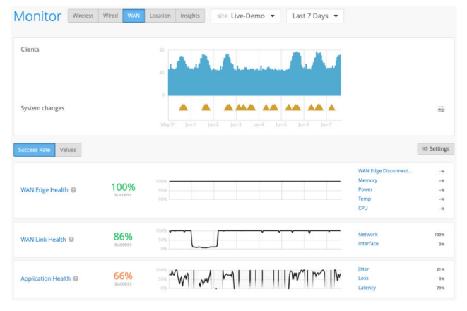
Figure 1: WAN Service Level Experiences

Get operational visibility into user WAN experiences with SLEs for Session Smart Routers or SRX Series Services Gateways. Measure the impact of both gateway and WAN circuit health on end-user application experiences. A WAN Link Health SLE, which accounts for network congestion, cable issues, and ISP network availability, delivers insights into how these factors are affecting a given network user or application. The Juniper Mist SLE dashboard helps to identify root causes of suboptimal application experiences in just a few clicks and proactively isolate "needle-in-a-haystack" problems (Figure 1).