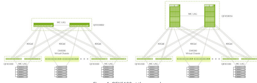
Figure 1: QFX5100 at the access layer

The QFX5100 line offers a portfolio of switches that deliver the low-latency, lossless, high-density 10GbE and 40GbE interfaces with the Fibre Channel over Ethernet (FCoE) transit switch functionality demanded by today's data center. All QFX5100 models are designed to consume the lowest power possible while optimizing space, thereby reducing data center operating costs. Flexible airflow direction options enable the QFX5100 to support back-to-front and front-to-back cooling, ensuring consistency with server designs for hot- and cold-aisle deployments.