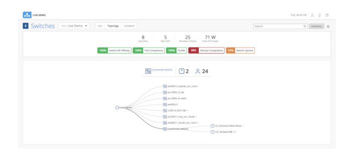
Figure 6: Wired Assurance topology view

Wired Client Health Metrics. See an inventory of switches and wired devices in a list, topology, or location view. Wired Assurance ensures optimal network operations with key health metrics, such as switch firmware compliance, switch AP affinity, PoE compliance, and missing VLANs. These metrics are available for multivendor environments across third-party wired switches with a Juniper access point and Marvis license. The addition of BPDU Guard and MAC limit hit error identification enhances the ease of administrating port security at scale.