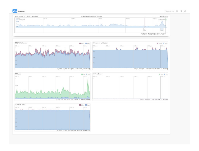
Figure 4: Switch health metrics

Al-Driven Switch Insights. Know exactly how Juniper EX and QFX Switches are performing with detailed device-level switch metrics and insights such as CPU, memory utilization, and virtual chassis status, You can also see metrics down to the port level, including bytes transferred, traffic utilization, and power draw. You'll receive performance series data and real-time status data for connected endpoints. Wired Assurance also logs and correlates switch events, like configuration changes, firmware updates, and system alerts. When admins hover over switch ports on the management interface, status details pop up about wired clients, access points, and connectivity, such as connected speed, PoE status, and throughput.