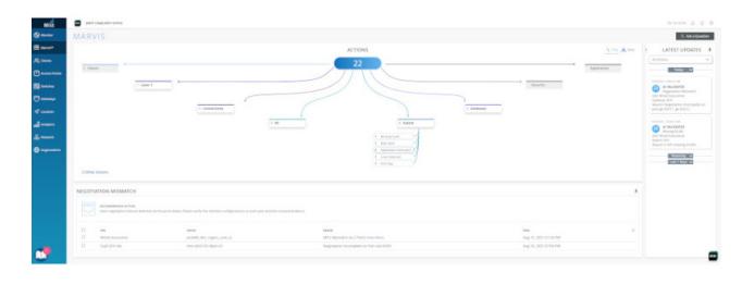
Figure 2: EVPN multihoming configuration via Juniper Mist cloud

Assurance brings cloud management and Mist AI to campus fabric. It sets a new standard, moving away from traditional network management towards AI-driven operations, while delivering better experiences to connected devices.