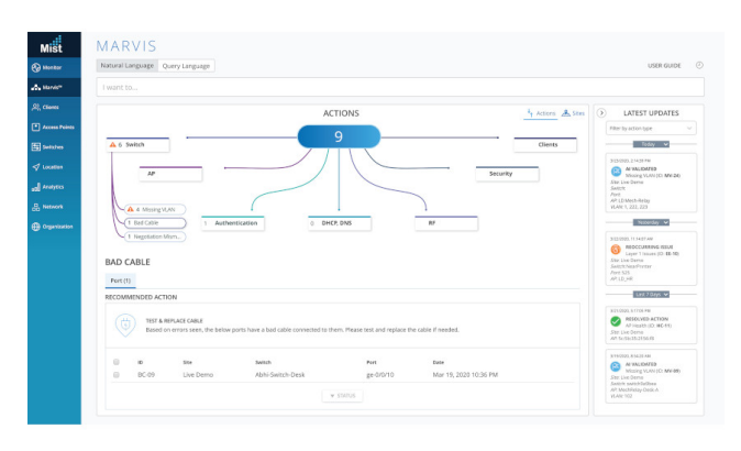
Figure 9: Marvis Actions for wired switches

Network Insights . Wired Assurance includes a base analytics capability for analyzing up to 30 days of data, which simplifies the process of extracting network insights from data and analytics across your enterprise. Review your network throughput peaks to properly align your support resources. If you want to extend these capabilities to third-party network elements, consume up to one year of data, and gain the option of generating customized reports, Juniper Mist Premium Analytics is available as an additional service.