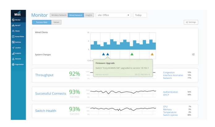
Figure 3: Juniper Mist Wired Assurance service-level expectations

Wired Service Level Expectations (SLEs). Get operational visibility into the wired experience with SLEs for Juniper EX and QFX Switches. Enforce throughput, successful connects, and switch health with pre- and post-connection performance metrics. Preconnection shows the number and time of successful connects and authentication, while post-connection measures throughput and detects STP loops, interface errors and congestion—all in one dashboard. SLEs help to measure and manage networks for simplified troubleshooting and proactive anomaly detection.