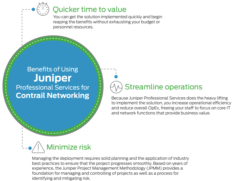
Figure 2. JumpStart service benefits