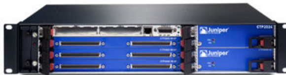
CTP2024 Circuit to Packet Platform