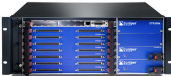
CTP2056 Circuit to Packet Platform