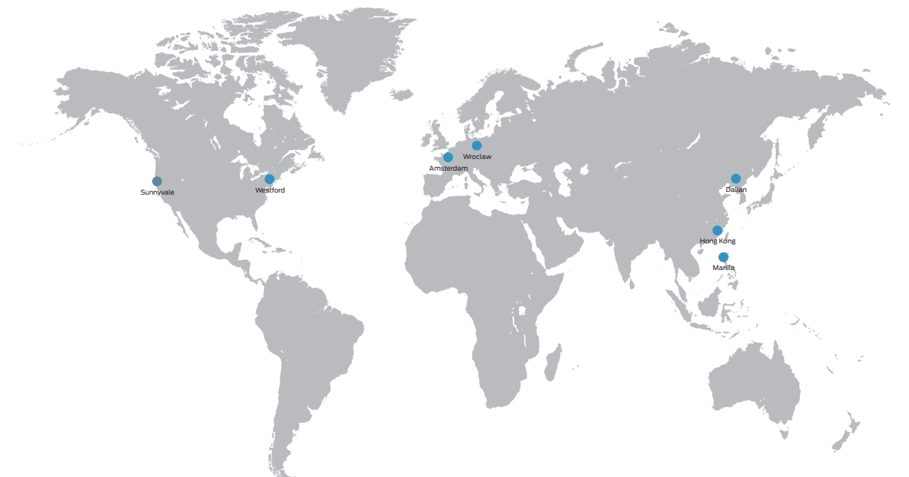
Figure 1: Global Customer Care

For non-English speaking customers, our Customer Care representatives can provide support in a number of languages such as Arabic, Dutch, French, German, Japanese, Korean, Mandarin, Polish, Putonghua, Russian and Spanish. They also have access to translation services to help facilitate communication in most other business languages.