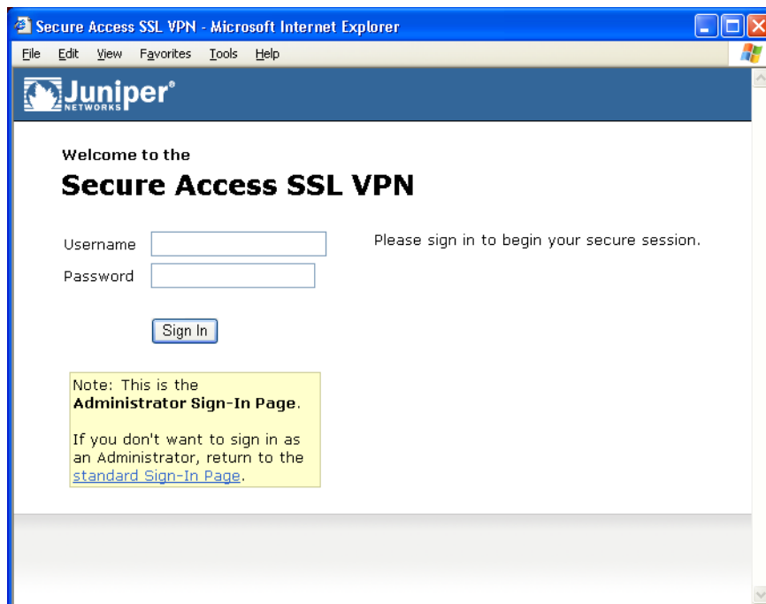
Figure 2: Administrator Sign-In Page