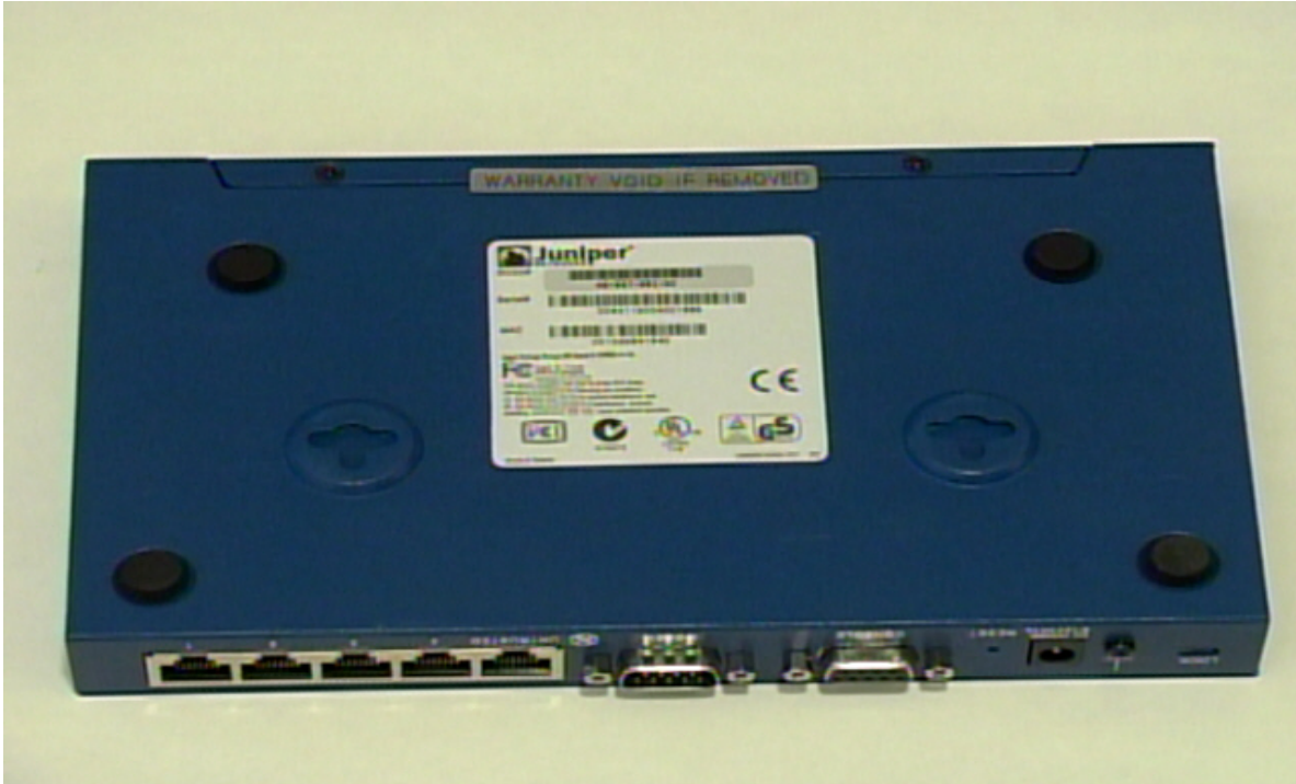
Figure 2: Underside of the NS-5GT device