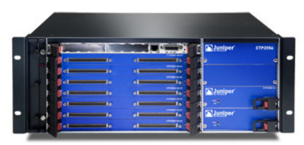
CTP2056 Circuit to Packet Platform