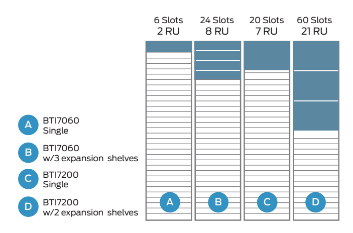
Figure 3: BTI7000 configuration options